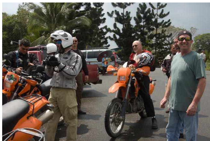
Some of the boys and their mounts back in Costa Rica.

The first day's ride would be a short one to Ciero de la Muerta and the Trogon Lodge. Although the ride was short, there would be our first motorcycle accident with one rider dropping his KTM in the loose dirt on the way down to the lodge. Fortunately there was no serious injury, only a slight bruise to the ego and minor damage to the bike. The lodge was a rather pleasant surprise and, for all practical purposes, could have easily been taken for something one might find along the California coast around Big Sur – minus the ocean that is. We all got to enjoy the clean cool mountain air and a delicious dinner. The real surprise came the next morning when we woke to find frost on our bikes. The bikes started without any problems and off we went over hill and dale to the Esquinas Lodge down toward Golfito on the Pacific coast. The town was rather poor and had shown the ill effects of time passing it by. Some of the guys