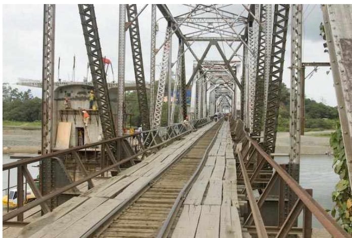
The Panama/Costa Rica border crossing at Sixaola.

Another early morning start would be the order of the day. We awoke to clear cool skies and beautiful roads with magnificent views that were hard to beat. Today's ride would be the longest of the trip but we would be