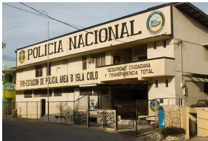
A room with a view courtesy of the National Police of Panama. Fortunately, no one got a first hand view.

After one night at the Esquinas Lodge and our first injury of note, we would be off to Panama and our first border