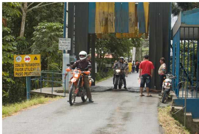
That was a walk in the park. Any more bridges to cross?

In any case, I would like to think that I was prepared in that I put on my flimsy life preserver and unzipped my riding boots in anticipation of slipping into the drink. Luckily, my fears were ungrounded and we made it to our destination. I cannot do justice to describing this island as it was nothing at all like anything that I've seen before and nothing like what I expected. That said, the hotel was right up the street, a short walk from the ferry terminal. (Terminal would be a gross exaggeration by anyone's standards.) In any event, the hotel was right on the water and was clean and not lacking in character.