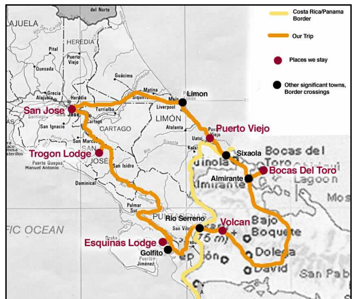
An overview of the route. Two border crossings.