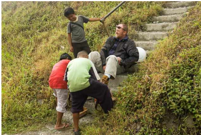
Shine anyone? Now this is attention to detail. All this for a dollar.

(Continued from page 7) After finally getting in to Panama, the group had lunch at a local outdoor cantina. Good chicken was the order of the day and then off we went. The roads were immediately a vast improvement over what we had been accustomed to in Costa Rica. We finally managed to make it to a nice Italian restaurant just a couple of miles from destination, the Hotel Bambito