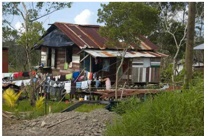
What real estate bubble? Makes you want to stop and think. This abode was just a block away from the local airport in Bocas del Toro.

crossing. One of the guys decided to venture off solo into the jungle, never a good idea, and proceeded to slip on a rock while crossing a stream. The injury, while not serious, could have easily been much worse. Still it would pose problematic and make riding and walking difficult and uncomfortable for the remainder of the trip for this one rider. As it later turned out, (not until after