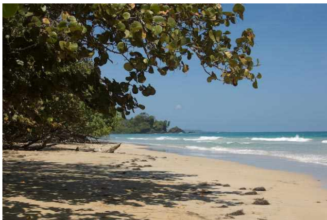
La playa at Bocas del Toro.

(Continued from page 8) some key FARC leaders. After informing the guys on our intended route back into Costa Rica, the guys showed me a picture of the bridge we would be crossing. The planks and gaps would prove problematic for a couple of riders the next day as not only was the bridge rickety, the planks would have gaps that could swallow a front tire if you weren't careful enough to avoid them. One rider dropped his BMW F650GS, while another rider would freeze up and opt to walk the bridge sans motorcycle. I took the large KTM 950 Adventure only to have to stop approximately one-quarter of the way across when an oncoming bus was headed in my direction. Did I mention that this was a one lane bridge? Walking the bike back was more unnerving than riding the darn thing in the first place. Thankfully, the border crossing here in Sixaola was far simpler than crossing into Panama several days earlier, the bridge notwithstanding.