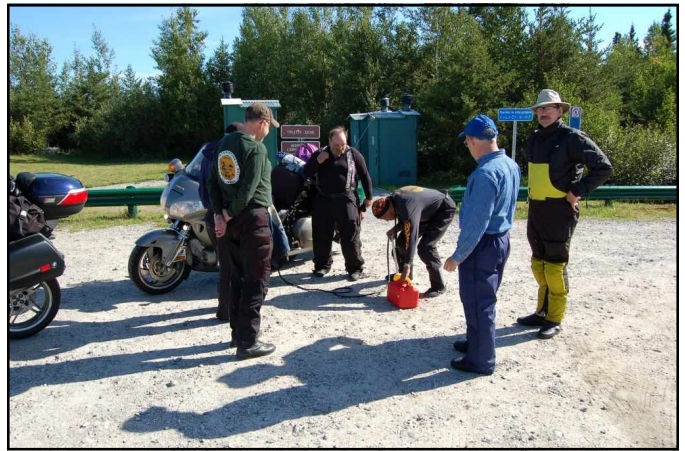
We gassed up the bikes needing gas and proceeded to THE GAS STATION!

This was the main objective of the trip. We had arrived at the Rupert River Rapids! The Rapids will disappear next year with a new dam is completed by Hydro Quebec. Loud, wide, high, beautiful, one of kind, awesome, impassable, and a sight to behold are just some of the terms that can be applied to this display of nature's grandeur. As the group arrived one by one they got off their bikes and just stared at the magnificent sight. We began to take pictures realizing that no photograph could do this site justice. You had to be there!