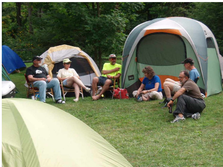
TT'ers at the Boone Rally