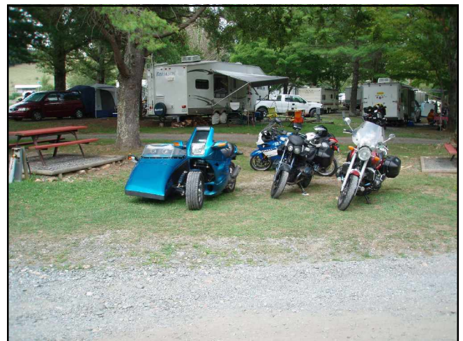
More Boone Rally Pictures