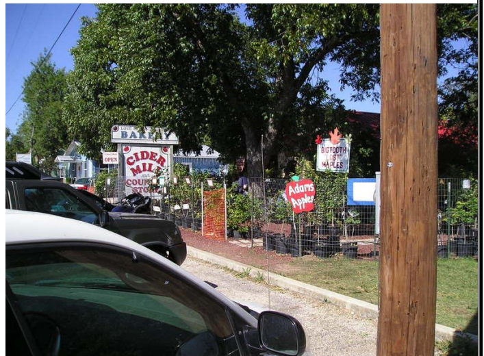
Cider Mill sign in Medina