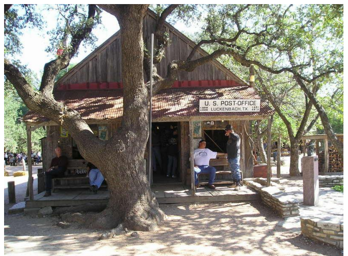
Luckenbach Post Office