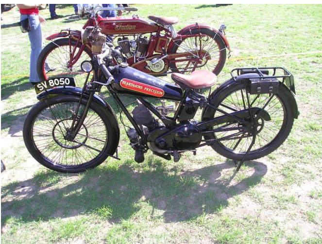
Some nice bikes!