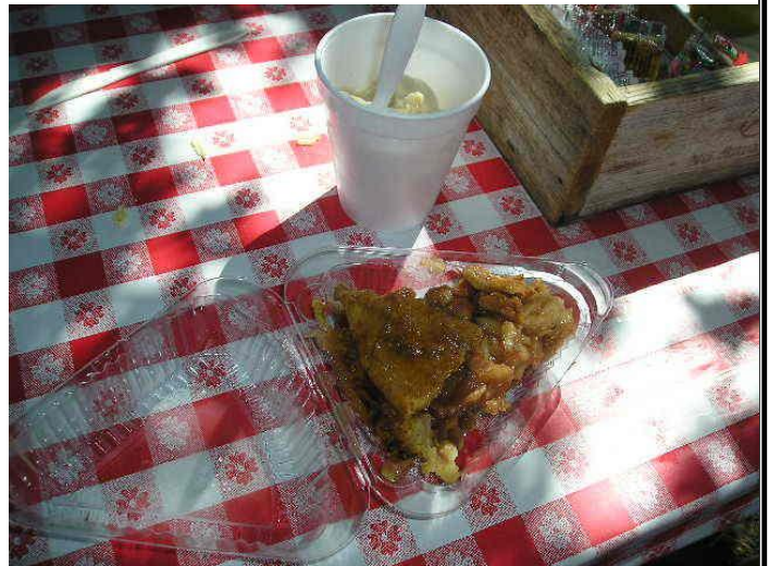
"Must Do" Hill Country Pie

After a bit we stopped in Medina for some Apple Pie. This is another "must do" in the Hill Country.