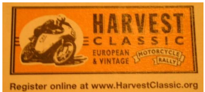
Harvest Classic logo