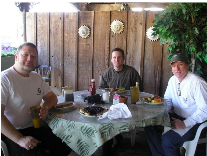
The three of us